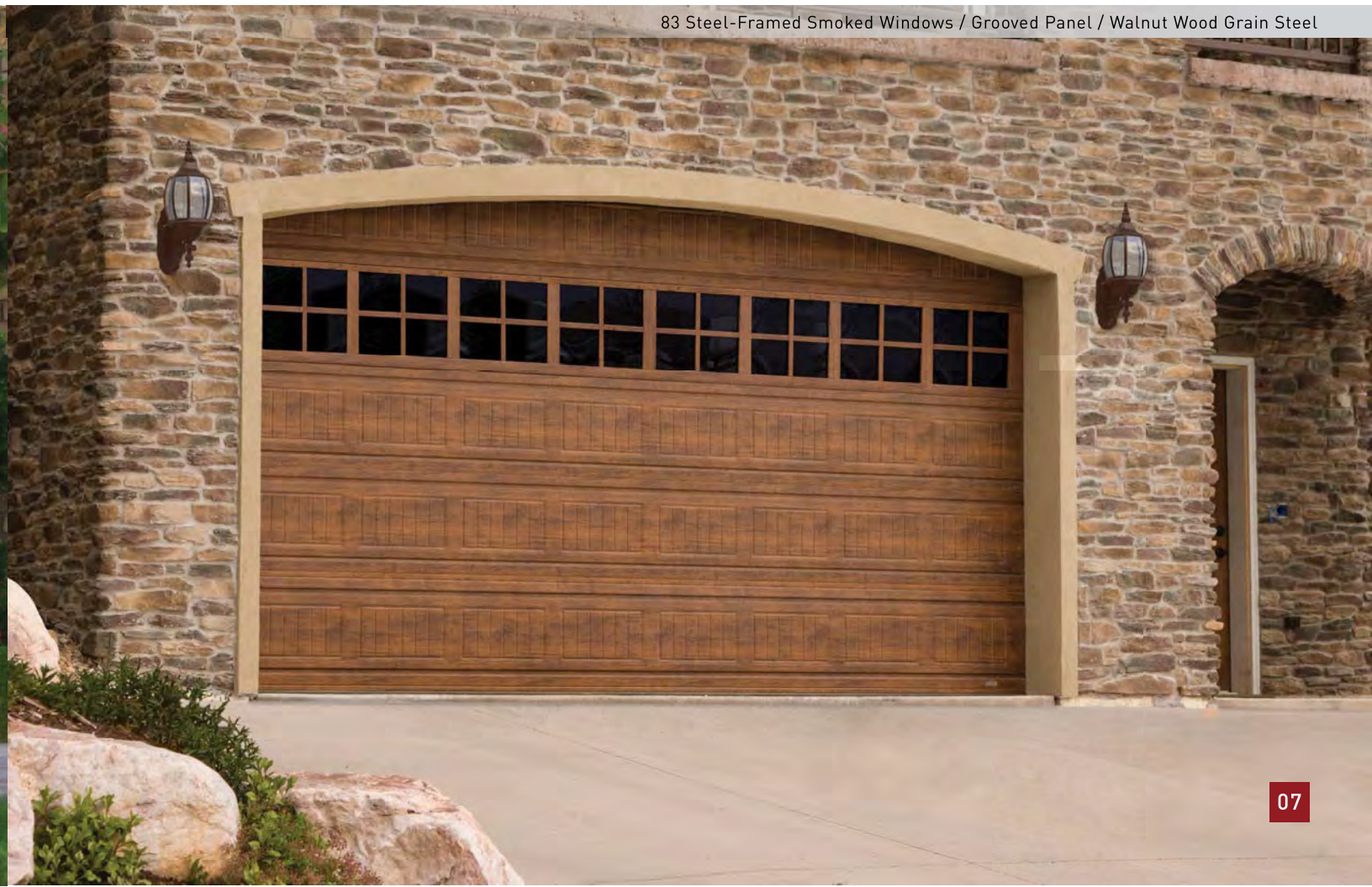
83 Steel-Framed Smoked Windows / Grooved Panel / Walnut Wood Grain Steel