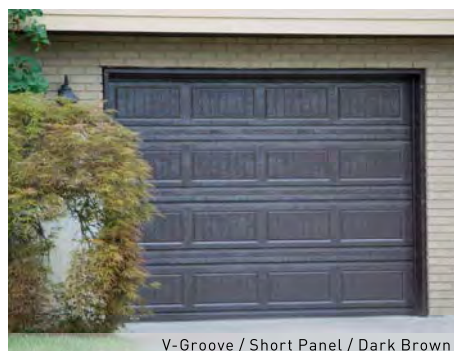
V-Groove / Short Panel / Dark Brown