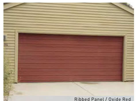
Ribbed Panel / Oxide Red