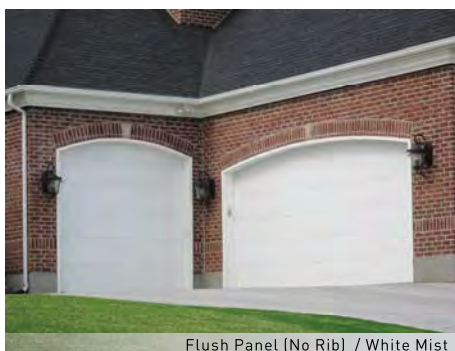
Flush Panel (No Rib) / White Mist

Safety Joint Martin safety joint helps protect fingers and hands from serious injury.