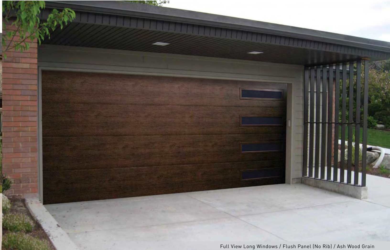
Full View Long Windows / Flush Panel (No Rib) / Ash Wood Grain