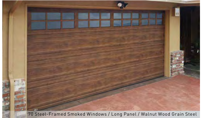
70 Steel-Framed Smoked Windows / Long Panel / Walnut Wood Grain Steel