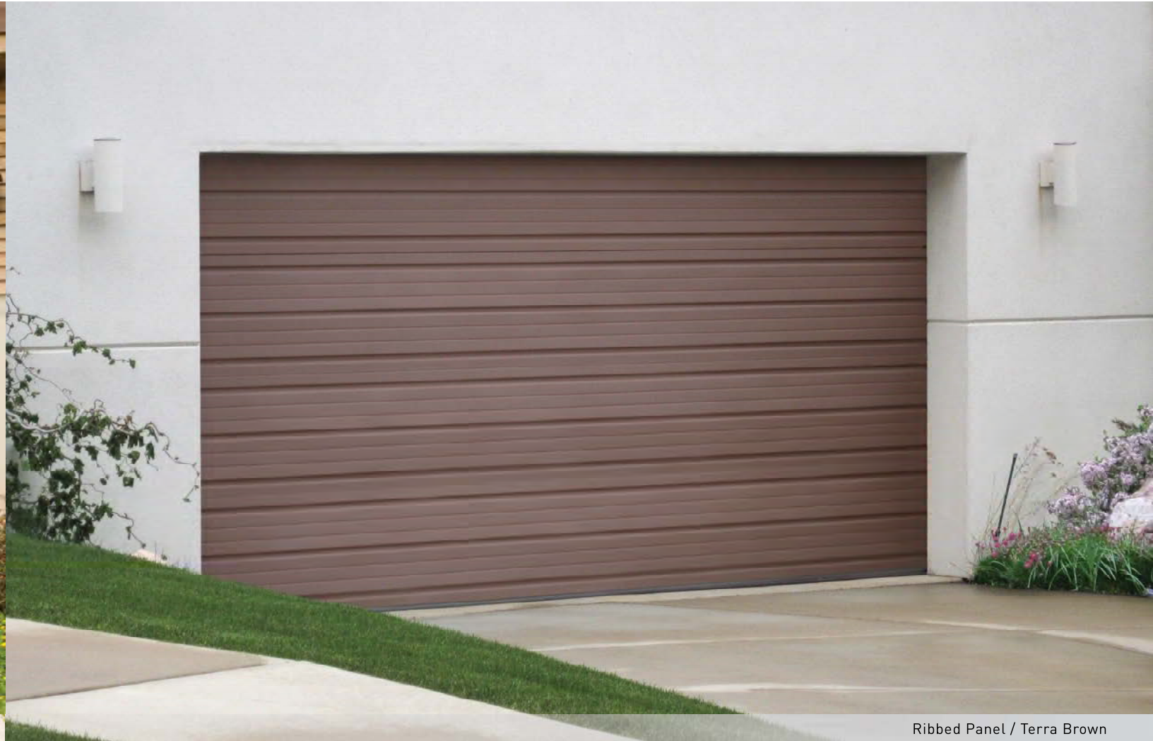
Ribbed Panel / Terra Brown