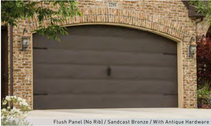
Flush Panel (No Rib) / Sandcast Bronze / With Antique Hardware