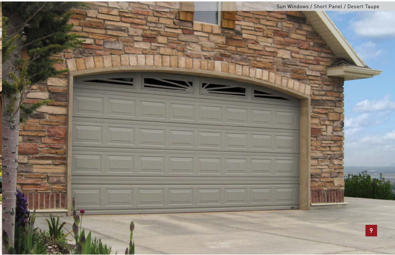
Sun Windows / Short Panel / Desert Taupe